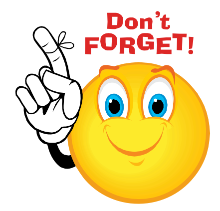
The 2011 Emerging Trends in Fraud Training is May 16-17. So, mark your calendars.